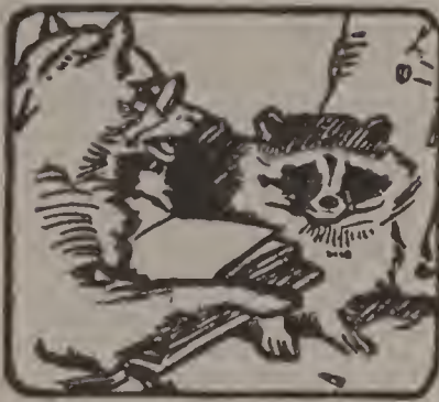
Dr. Red Fox Was Reading a Book.

“I MUST tell you,” said daddy to Jack and Evelyn, “about Spud Coon’s New Year’s resolutions. Spud Coon had been a very naughty raccoon during the Christmas holidays. He had been stealing a great many of Farmer Wells’ chickens. He had given a number of chicken feasts and had also gone to many dances. He had always come home very much exhausted and stayed in bed late every morning.